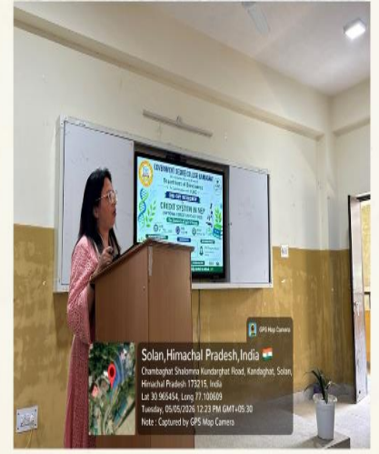
Solan, Himachal Pradesh, India Chandbaghat Shaloma Kandaghat Road, Kandaghat, Solan, Himachal Pradesh 173215, India Lat 30.965454, Long 77.100609 Tuesday, 05/05/2026 12:23 PM GMT+05:30 Note: Captured by GPS Map Camera