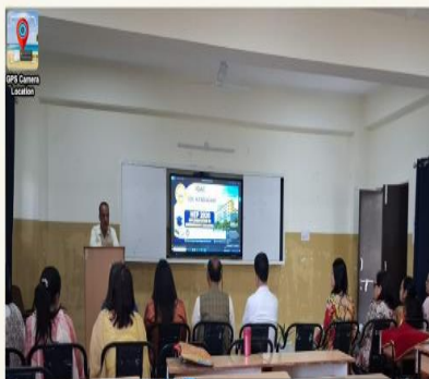
Kandaghat Himachal Pradesh India 25°C X484+93M, Kandaghat, Himachal Pradesh 173215, India