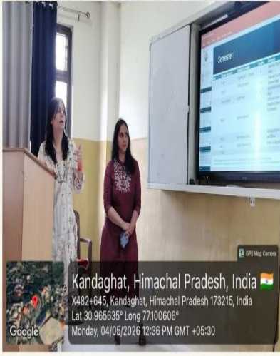
Kandaghat, Himachal Pradesh, India X482+645, Kandaghat, Himachal Pradesh 173215, India Lat 30.965635° Long 77.100606° Monday, 04/05/2026 12:36 PM GMT +05:30