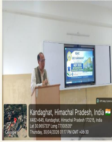
Kandaghat, Himachal Pradesh, India X482+645, Kandaghat, Himachal Pradesh 173215, India Lat 30.965733° Long 77.100535° Thursday, 30/04/2026 01:17 PM GMT +05:30