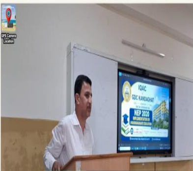
Baror Himachal Pradesh India 25°C X3JM+CQX, Baror, Himachal Pradesh 173215, India