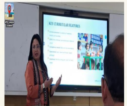
Kandaghat Himachal Pradesh India 25°C X482+645, Kandaghat, Himachal Pradesh 173215, India